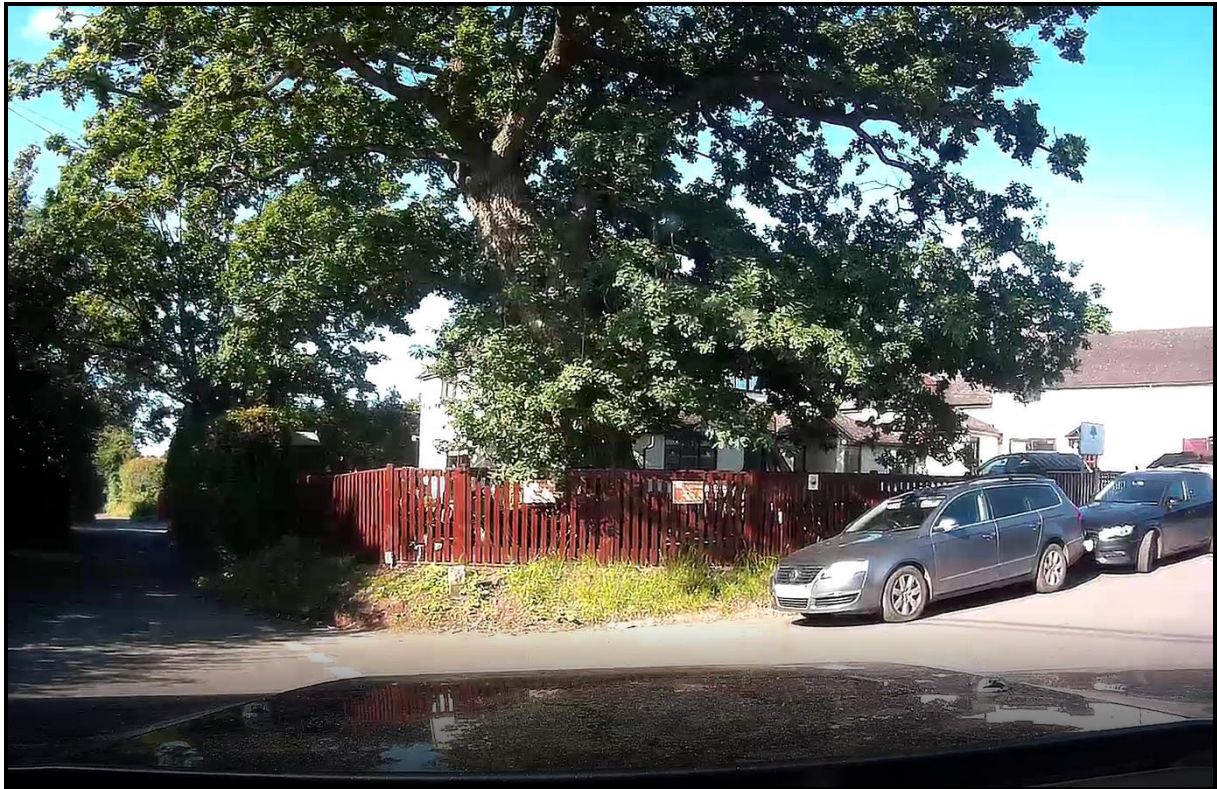
From the C1273 Ross Road turning left into the U70419 Church Road with cars parked on approach